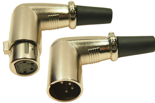
Part Nos: FC60954N - 4 Pin Female XLR plug FC60964N - 4 Pin Male XLR plug