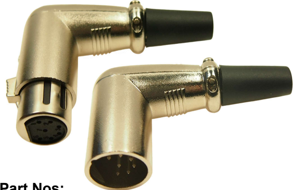
Part Nos: FC60957N - 7 Pin Female XLR plug FC60967N - 7 Pin Male XLR plug