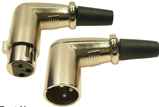
Part Nos: FC60953N - 3 Pin Female XLR plug FC60963N - 3 Pin Male XLR plug