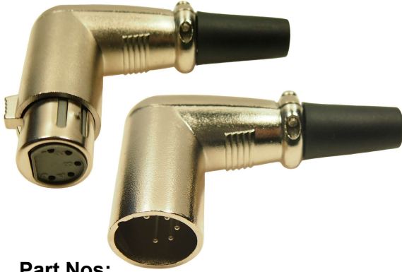
Part Nos: FC60955N - 5 Pin Female XLR plug FC60965N - 5 Pin Male XLR plug