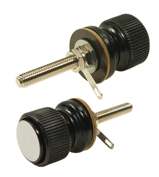
Part No. CL15001R