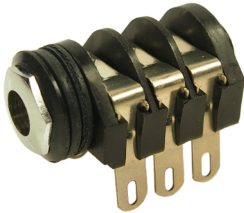
S4/BBB Solder Tag