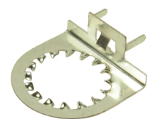
S4 EMI/RFI Screen

Drawings available on request. Contact sales@cliffuk.co.uk