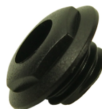
S4 Combined Nut & Bezel