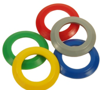
S2 Coloured Bezels

For example, S4/BMB/PC-C is a 3-pole stereo jack socket, 1st contact - Break, 2nd contact - Make and 3rd contact - Break with PC-C style contacts.