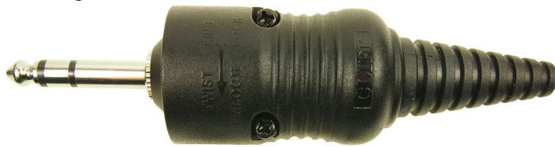
Mono Straight Type - CL2075 Stereo Straight Type - CL2075S

Cliffcon™ Jumbojack addresses this problem. It allows large diameter cable to be connected to conventional ¼" jack plug contacts, and has large / secure screw type cable clamps, to keep the cable in place. The cable grommet is useable up to Ø12.5mm. For Ø15mm, discard the grommet.